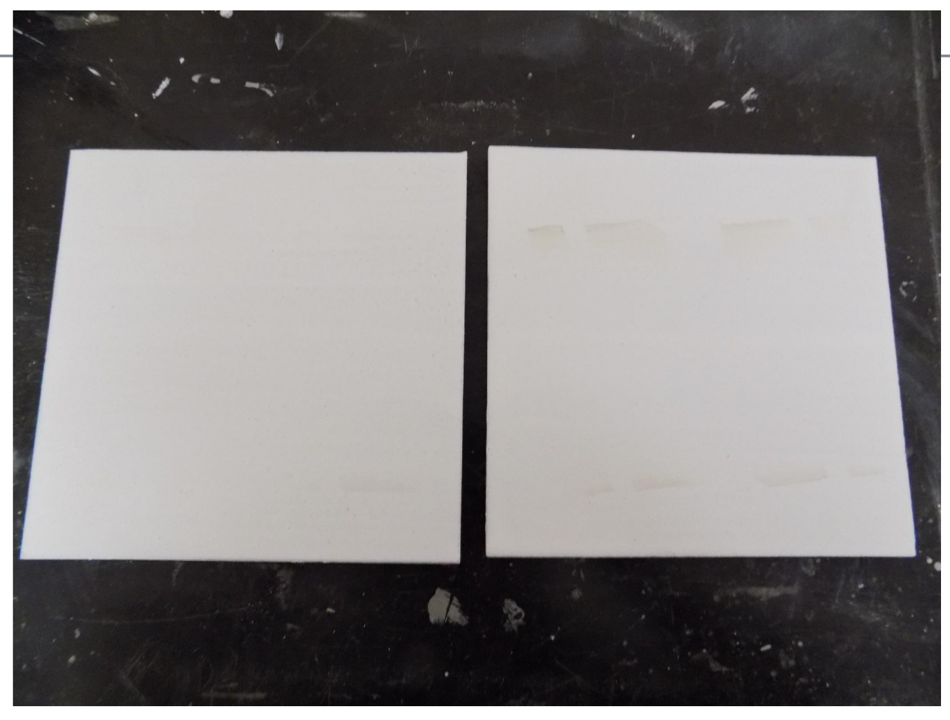
Precondition 30 minutes @ 60C